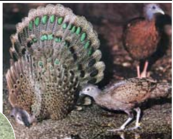
Malayan peacock pheasant. -Dolora Jung