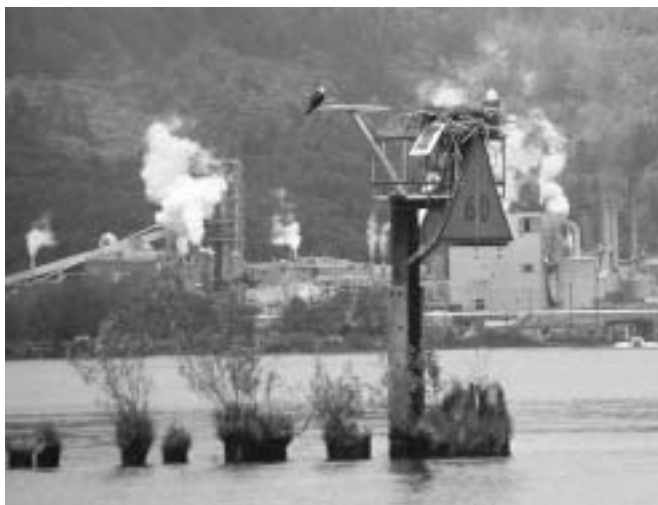
Figure 3. Osprey ( Pandion haliaetus ) nest on an easily accessible (with U.S. Coast Guard approval) channel marker near a paper mill on lower Columbia River (River Mile 44) downstream of Portland, Oregon. Ospreys nest at regular intervals along some major river systems and bays which can result in strategic or random sampling of eggs or blood for contaminant evaluation (Photo by J. Kaiser, USGS).

areas of high exposure; however, effects are difficult to separate not only from DDE, but also from ecological factors such as food supply (Dykstra et al. 1998, Elliott and Norstrom 1998, Elliott et al. 1998, Gill and Elliott 2003, Elliott et al. 2005a).