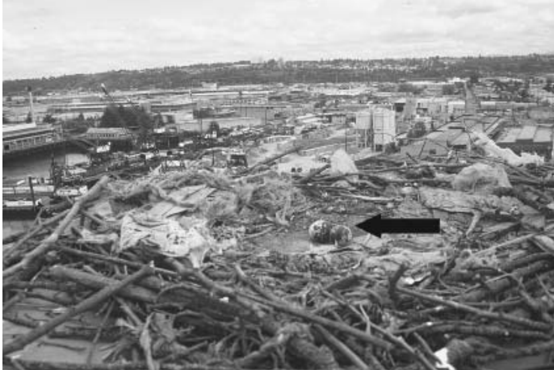
Figure 1. Increasing Osprey ( Pandion haliaetus ) populations have pioneered back into some potentially contaminated industrial sites, e.g., Seattle Harbor, U.S.A., where they are again being used as an indicator species to evaluate numerous contaminants. Note Osprey nest with two eggs in the foreground (Photo by J. Kaiser, USGS).

percentage of deaths attributed to dieldrin decreased following a ban on its use (i.e., 13% in 1966–70, 6.5% in 1971–74, 3.0% in 1975–77, and 1.7% in 1978–83). Decreases in mortality and increases in natality in the late 1970s and 1980s were followed by population increases in those species adversely affected in earlier years. The best evidence of the impact of dieldrin poisoning is the long-term study of Eurasian Sparrowhawks ( Accipiter nisus ) in Britain (Newton et al. 1986). A recent re-analysis of these data shows that at least 29% of the sparrowhawks in the area of high cyclodiene use died directly from dieldrin poisoning, which led to a population decline (Sibley et al. 2000). Comparison of temporal trends in populations of Sharpshinned Hawks ( A. striatus ) with both egg residues and usage patterns of dieldrin and DDT in North America support the possibility that dieldrin poisoning also may have impacted North American accipiters (Elliott and Martin 1994). Chlordane, persisting from earlier efforts to control turf pests in parks and gardens, recently poisoned songbirds and raptors, particularly Cooper's Hawks ( A. cooperii ) (Stansley and Roscoe 1999).