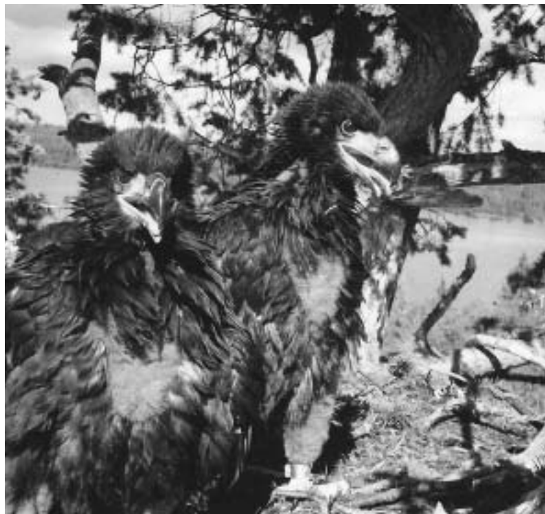
Figure 6. Juvenile Bald Eagles ( Haliaeetus leucocephalus ) at a nest in the Fraser Valley of British Columbia, Canada. Pre-fledging birds weigh about 4 kg and can provide a large quantity of blood for measurement of contaminants and biomarkers without any adverse effects. Sampling should be scheduled when young are about 6 weeks of age (Photo D. Haycock, CWS).

of Bald Eagle nestlings from British Columbia and California (McKinney et al. 2006; Fig. 6).