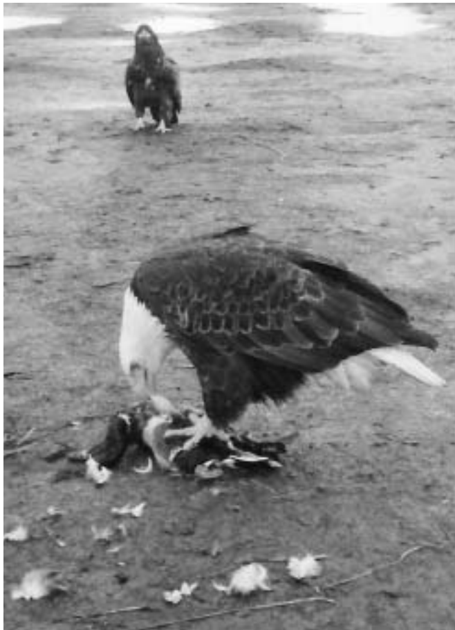
Figure 4. Bald Eagle ( Haliaeetus leucocephalus ) feeding on duck carcass in the Fraser River Delta of British Columbia, Canada. A single duck carcass can attract many Bald Eagles and other raptors, and is a prime vector of insecticides to birds of prey in that environment.