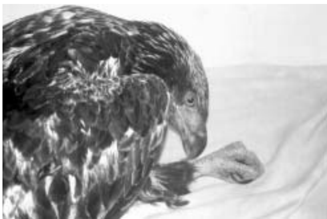
Figure 5. Juvenile Bald Eagle ( Haliaeetus leucocephalus ) from Fraser River Delta, British Columbia, Canada, with symptoms of anti-cholinesterase poisoning. Note dilated pupils, clenched talons and the inability to stand. The bird died 2 days later of phorate poisoning.

ary exposure (Henny et al. 1985). Unabsorbed famphur persisted on cattle hair (sampled at weekly intervals) under field conditions for at least 3 months, and magpies that ingested cattle hair died. One Red-tailed Hawk that consumed a magpie died from secondary poisoning 10 days after cattle treatment and another was found incapacitated about 13 days after treatment with blood plasma ChE inhibited 82%.