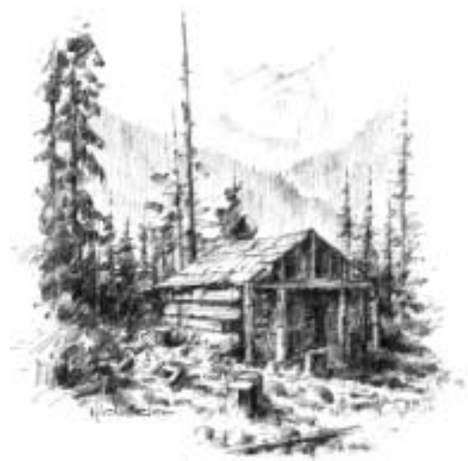
Cover painting and illustrations by Maggie Oliver